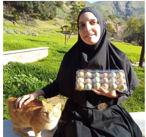
...and began laying their first colorful eggs.