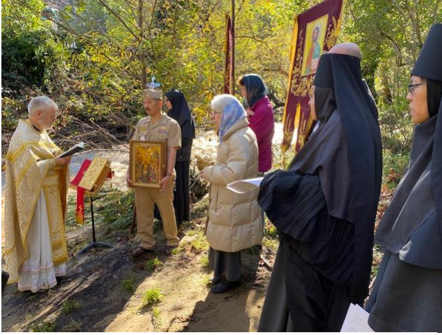
Blessing of the Waters. Note: the area where we are shown standing is now submerged.