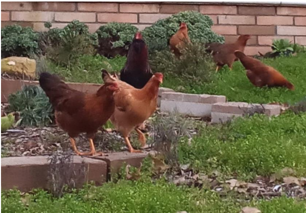
The chickens are all grown up